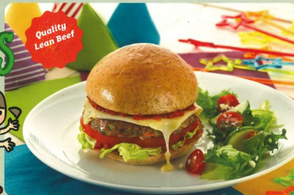
Beef Burger 牛肉汉堡