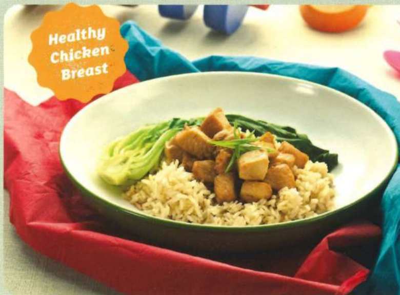
Healthy Chicken Breast