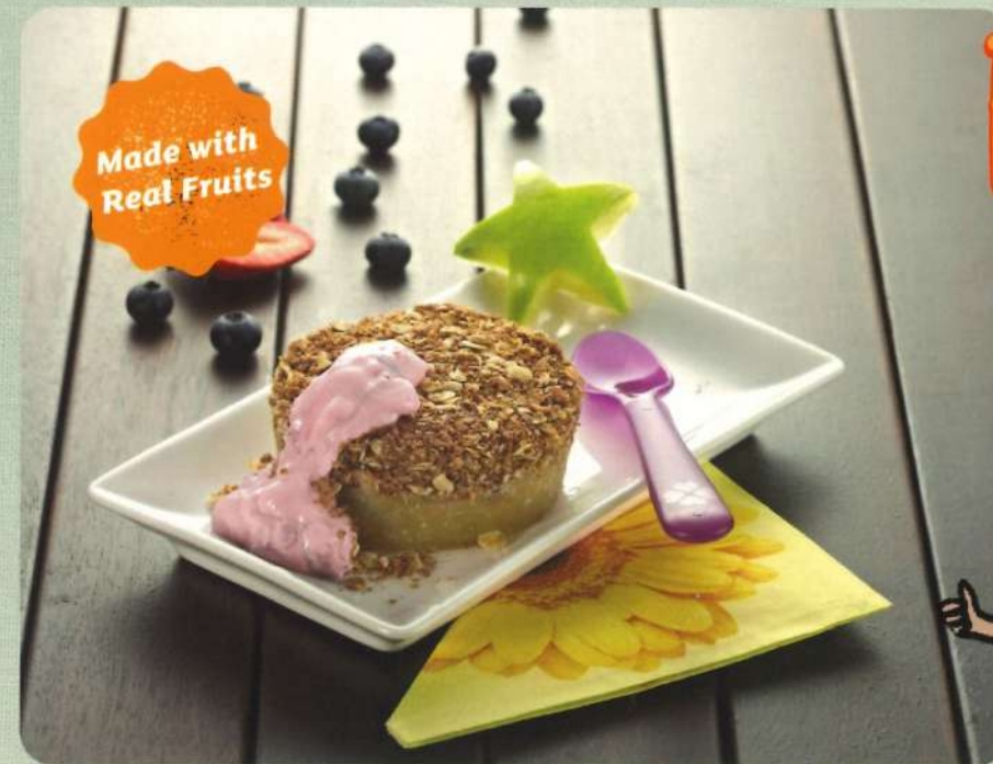
Made with Real Fruits